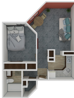
C One Bedroom 516 SQ FT