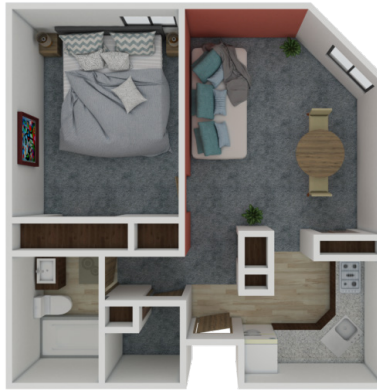
A1 One Bedroom 506 SQ FT