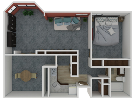
F Two Bedroom 773 SQ FT

Solstice Senior Living at Palatine 55 South Greeley Street, Palatine, IL 60067 (844) 494-6670 SolsticeSeniorLivingPalatine.com