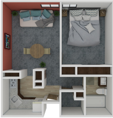
A One Bedroom 503 SQ FT

Solstice Senior Living at Palatine offers several floor plan choices to suit your needs.