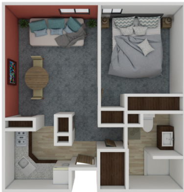
B One Bedroom 538 SQ FT