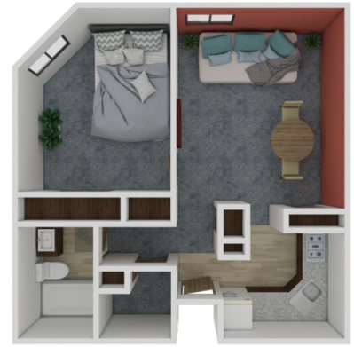
A2 One Bedroom 506 SQ FT